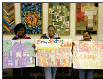
2009 Fire Poster Contest Winners