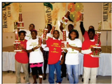
2009 Spelling Bee Winners